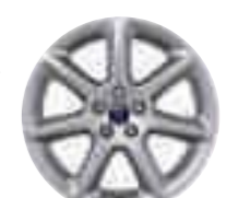
18" 7-spoke alloy wheel (optional on Titanium)

Note The 18" wheels and tyres available on Ford C-MAX are designed to deliver more sporting driving characteristics and a firmer ride quality compared to 16" and 17" wheels and tyres.