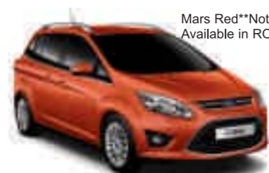
Mars Red**Not Available in ROI