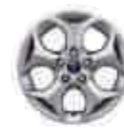
16" 5-spoke Y-design alloy wheel (standard on ACTIV)