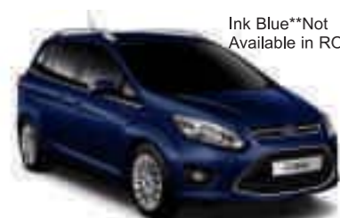
Ink Blue**Not Available in ROI