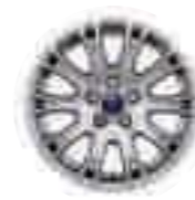
16" 10-spoke alloy wheel (not available in ROI)